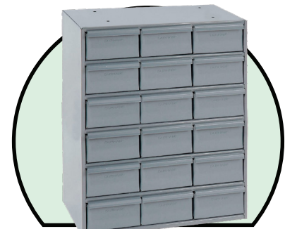
10: Steel 18 Drawer Vertical Cabinet (17 1/4" W x 21 1/4" H x 11 5/8" D)

Ask an IML Representative for full promotion details and product availability.