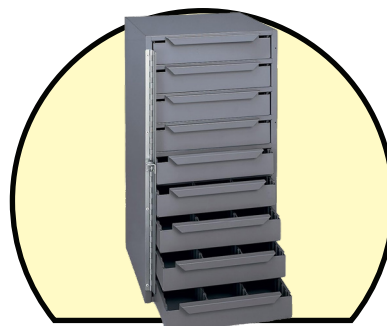
10: Steel 9 Drawer Cabinet (12 5/8" W x 24.5" H x 12 1/8" D)