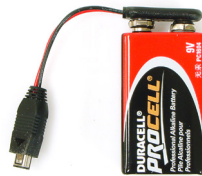
S&G 444 Device with attached 9-volt battery