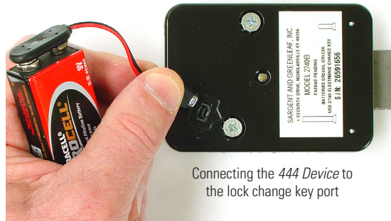
Connecting the 444 Device to the lock change key port