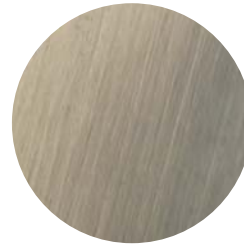
20 (US15A) Antique Nickel