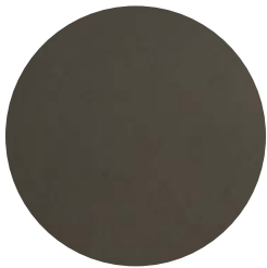
22 (US19) Flat Black