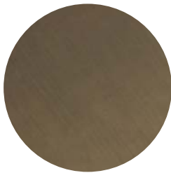
24 (US20A) Dark Bronze/ Clear Coat