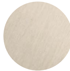
26 (US26A) Satin Chrome