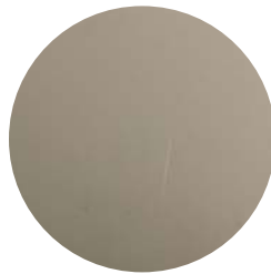
25 (US26) Bright Chrome