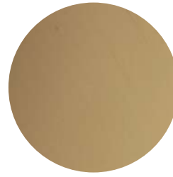
11 (US9) Bright Bronze