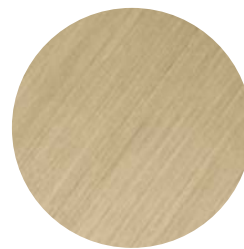
09 Antique Brass

Note: Product appearance may differ from this chart as a result of the differences in plated versus printed materials.