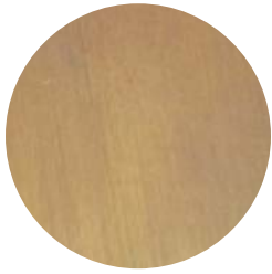
13 (US10B) Dark Bronze/ Oil Rubbed