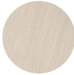
19 (US15) Satin Nickel