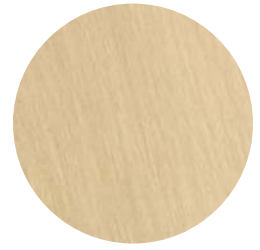
12 (US10) Satin Bronze