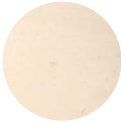
18 (US14) Bright Nickel