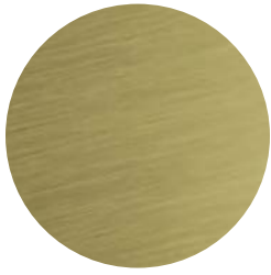
05 (US03) Bright Brass