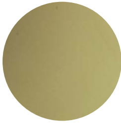
06 (US04) Satin Brass