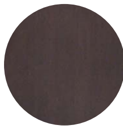
10 Satin Brass Blackened